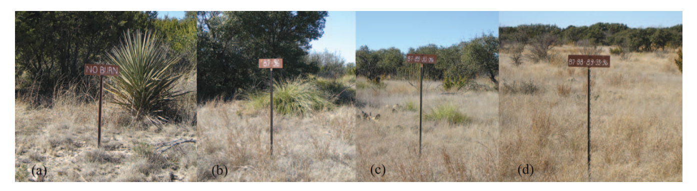
Figure 1. A visual comparison of adjacent experimental burn plots on the Texas AgriLife Research Station at Sonora, Texas. From left to right (a) has not been burned, (b) has been burned twice since 1987, (c) has been burned four times since 1987, and (d) has been burned five times since 1987.